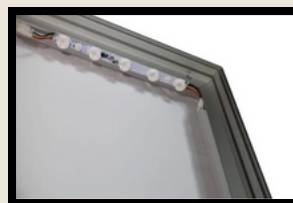
LED lighting on the back of a simple back wall light box

With exhibit technology being what it is now, you can do a light box as part of a hanging sign or even in a small booth space. Talk about standing out from your neighbors!