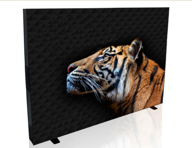
Light box backwall.

MAKE SURE YOUR GRAPHIC DESIGN IS ON POINT.